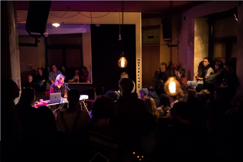
...and with Guests! ♥