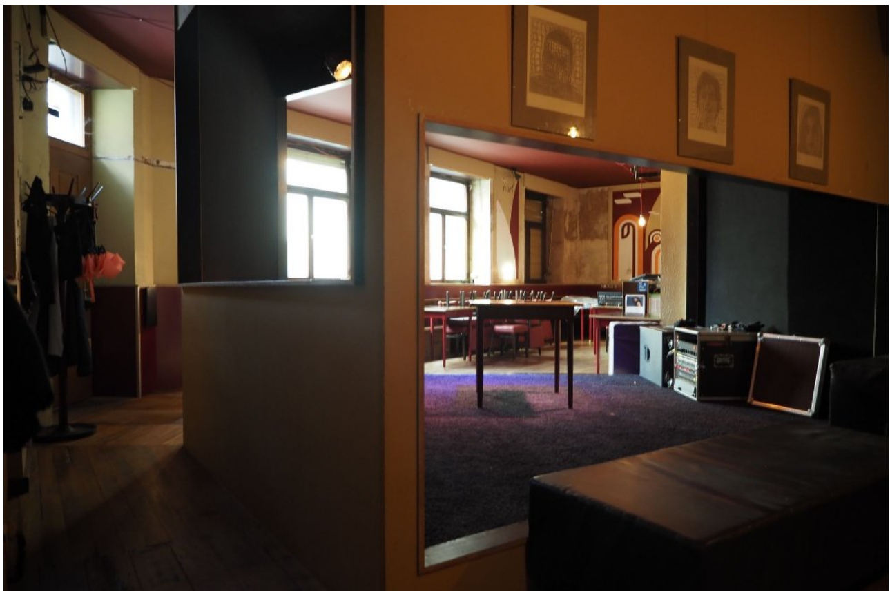
View from behind the stage