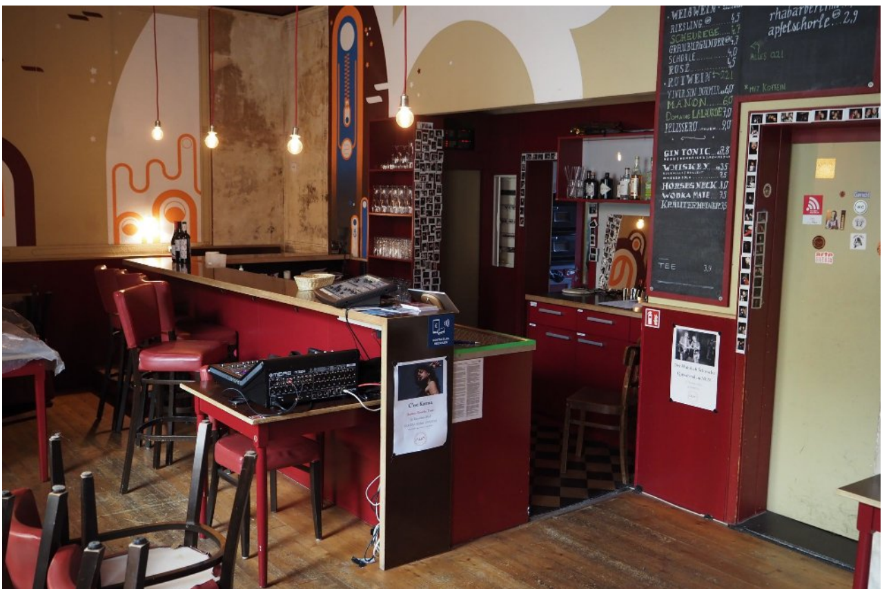
Our bar for happy times after the show :)