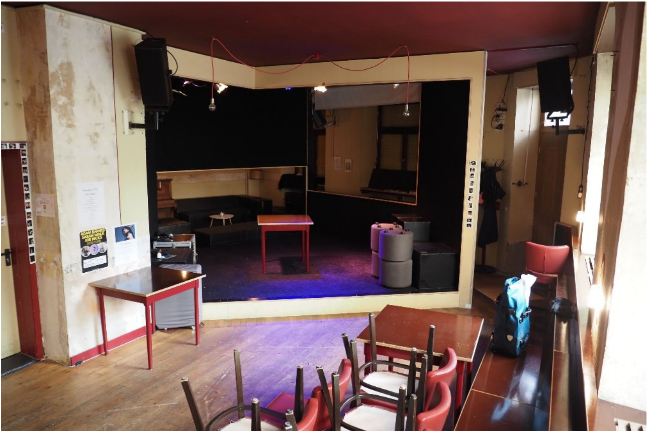
View of the stage (merch table is usually positioned left of the stage)